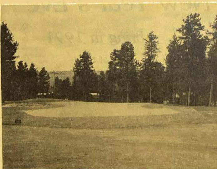
No. 11 Green