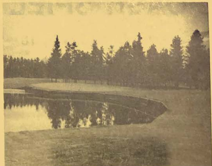
No. 17 Green