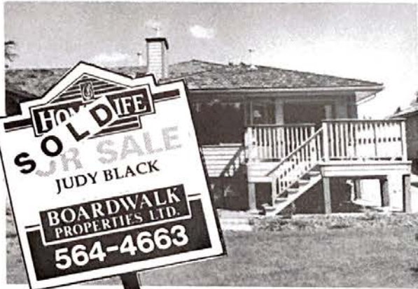
JUDY BLACK Realtor