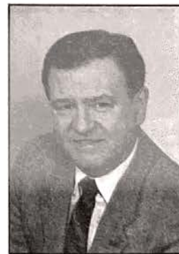
1997 Silver Award Winner