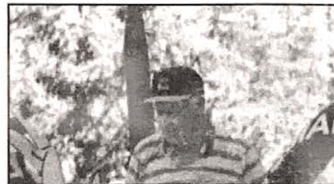
PGG&CC Winners at the 1998 BC Senior Games