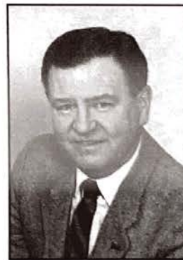
1997 Silver Award Winner