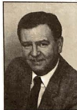
1997 Silver Award Winner