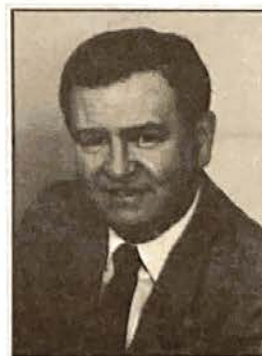
1997 Silver Award Winner