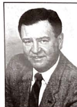
1997 Silver Award 1999