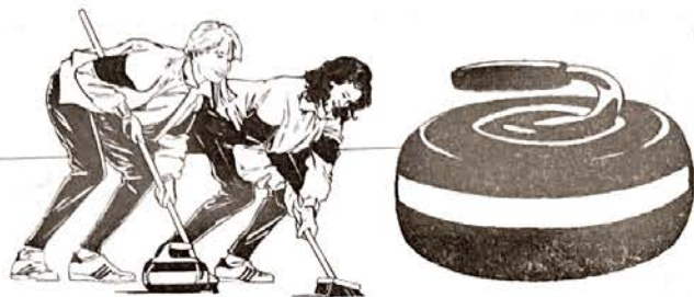
"C" Event Winners