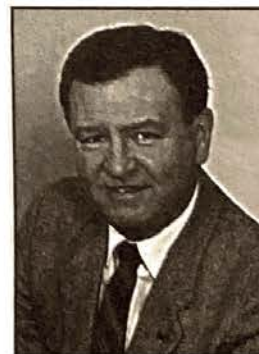
1997 Silver Award 1999